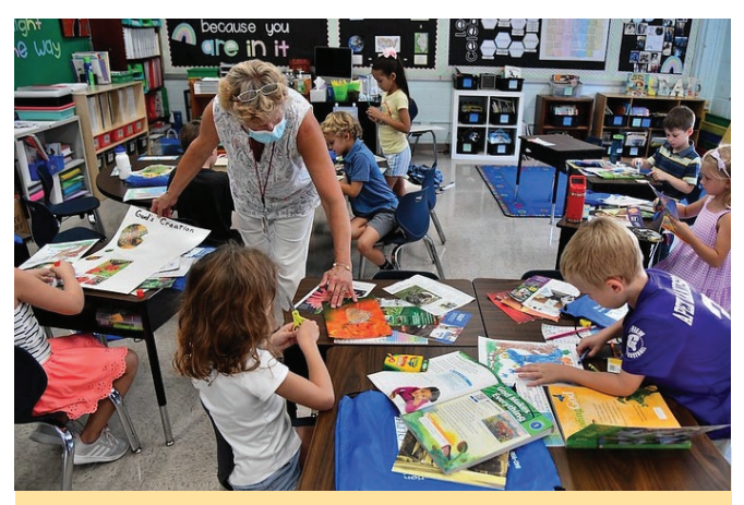
R.E. classroom in action!

Religious Education had a wonderful year with 435 students from Kindergarten through 8th grade enrolled in the program. During the 2022 – 2023 school year, two different learning models were offered. More than 435 students joined the Religious Education program on campus for weekly, in-person classes and 20 families participated in the Family Catechesis program.