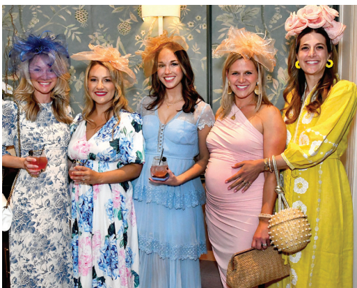
...they were ready to win, place AND show...