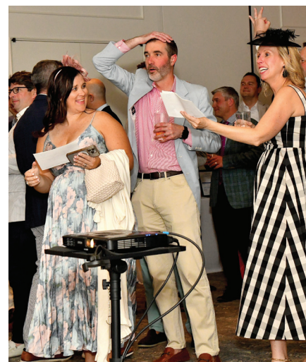
...or maybe better luck next time!