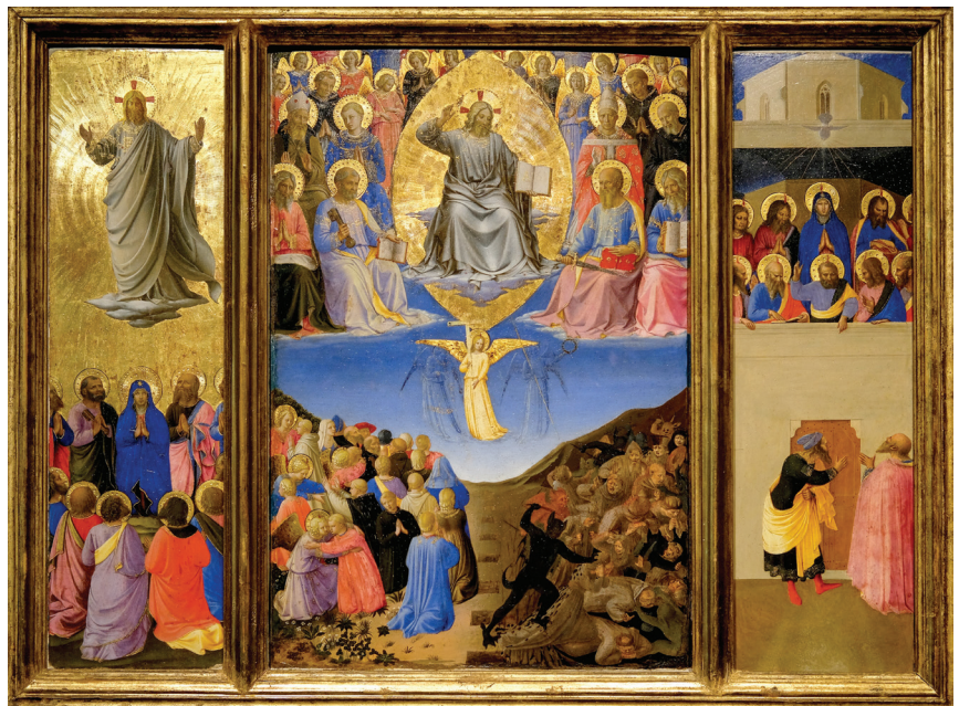
Fra Angelico, The Ascension of Christ, The Last Judgment, Pentecost