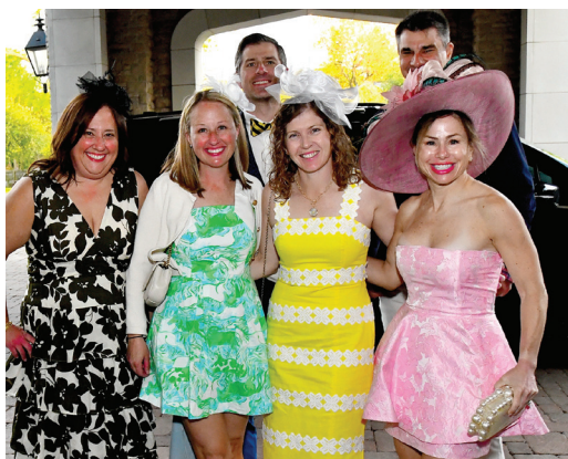
...women arrived dressed to the nines....