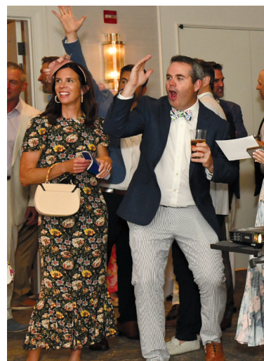
...because maybe tonight was their night...