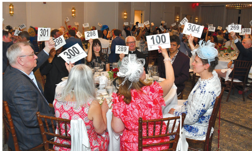
...all the paddles were up for the auction...