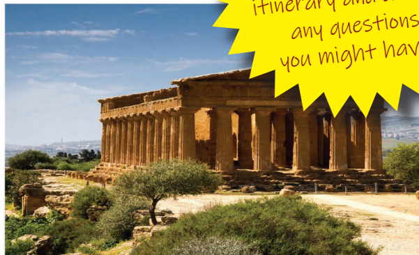
Valley of the Temples

Come to our travel meeting! 7:00pm, Jan. 17, in Hickey Hall. We will go over the itinerary and answer any questions you might have.