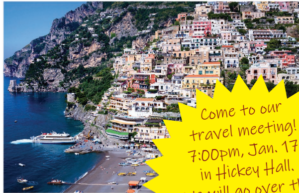
Positano, Amalfi Coast