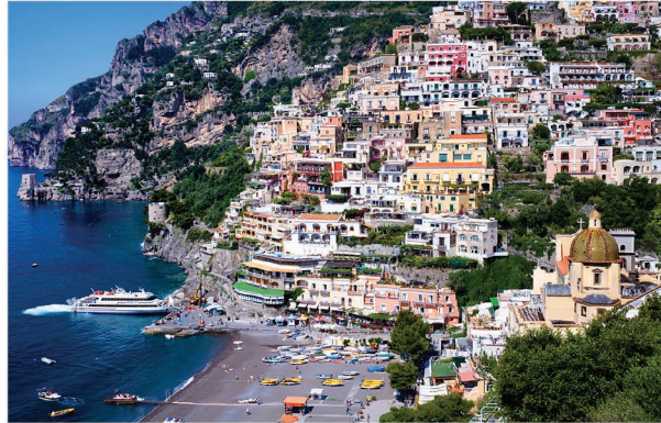
Positano, Amalfi Coast