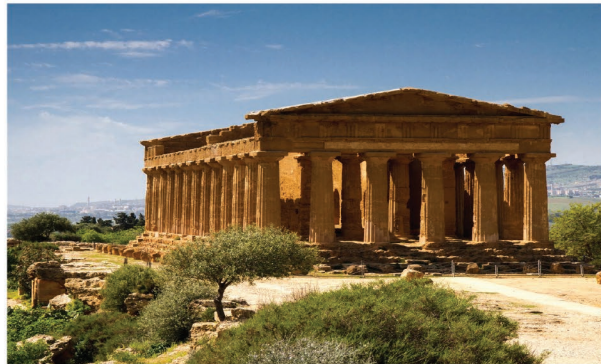
Valley of the Temples