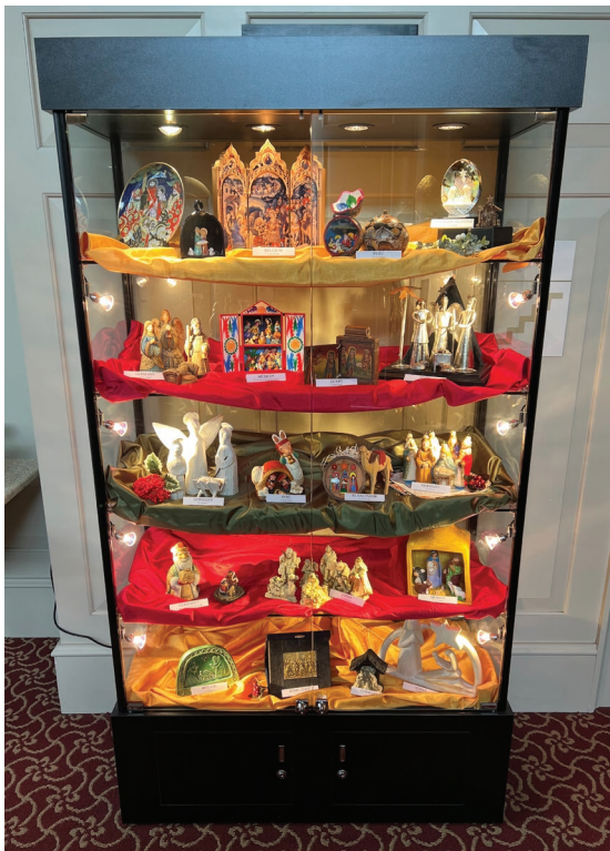
Nativity collections from around the world, currently on display in the South Vestibule of the church.