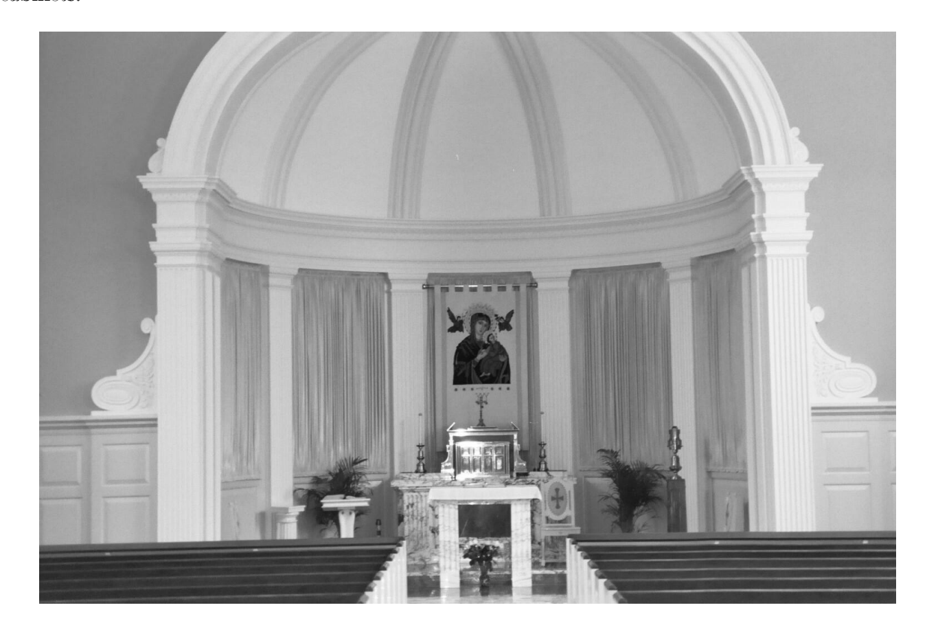
Our Lady Chapel

attractively paneled in enameled wood. Sacrarium, sinks, safe and other interior appointments, so often offensive to the sight, are all behind beautifully fabricated doors or in cabinets.