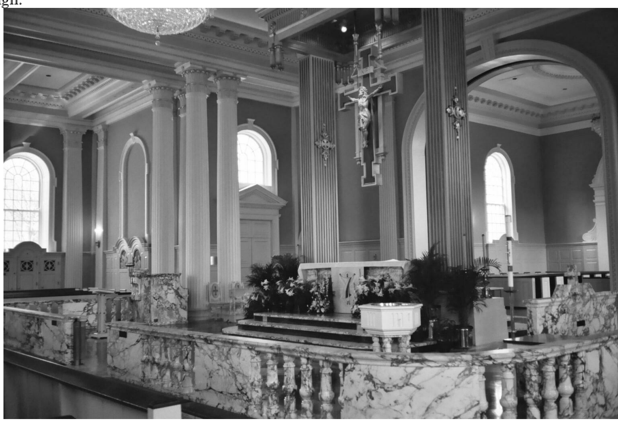
The Main Altar

All the marble and bronze work is specially designed in the Colonial style. The main altar is of Breccia Fina Seravezzi marble with panels of Ross Rubino Arni marble and weighs nine thousand pounds. The Mensa, or altar slab, is ten feet in length, weighs four thousand pounds and is a single slab of the same fine and beautiful marble. This stone is quarried in Piastraio in northern Italy, and was selected for its delicate veining. The red marble of the panels is from Arni, Italy, and the gray Bardiglio of the sanctuary floor is from the quarries of Serevezzi. Each was carefully chosen to complement the color of the creative design.