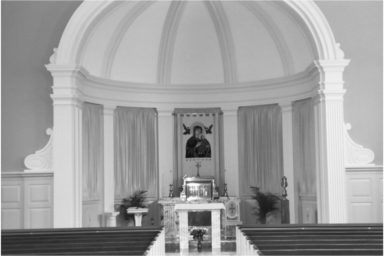
Our Lady Chapel

attractively paneled in enameled wood. Sacarium, sinks, safe and other interior appointments, so often offensive to the sight, are all behind beautifully fabricated doors or in cabinets.