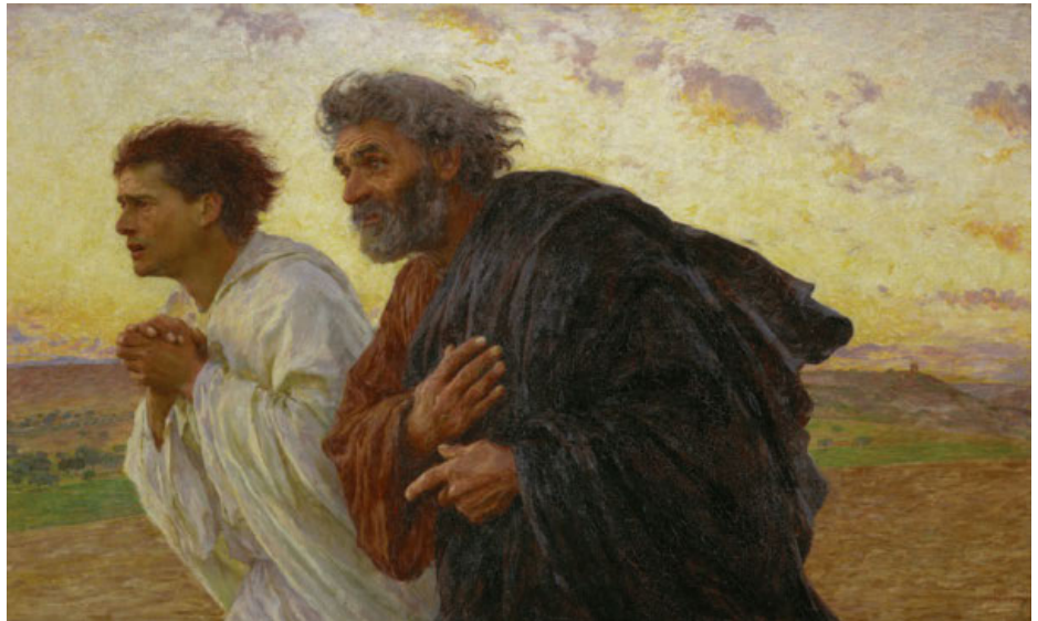
The Disciples Peter and John Running to the Sepulchre on the Morning of the Resurrection, Eugène Burnand, 1898

This brings me to the remarkable words of the Risen Christ in this weekend's gospel, "Blessed are those who