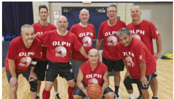
Over 40 runner-up: Team Karfis